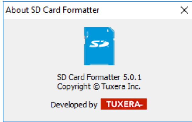
Figure 2: Version information

On Mac OS X/macOS operating systems, click the [SD Card Formatter] menu and then click [About SD Card Formatter].